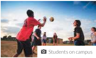
Students on campus