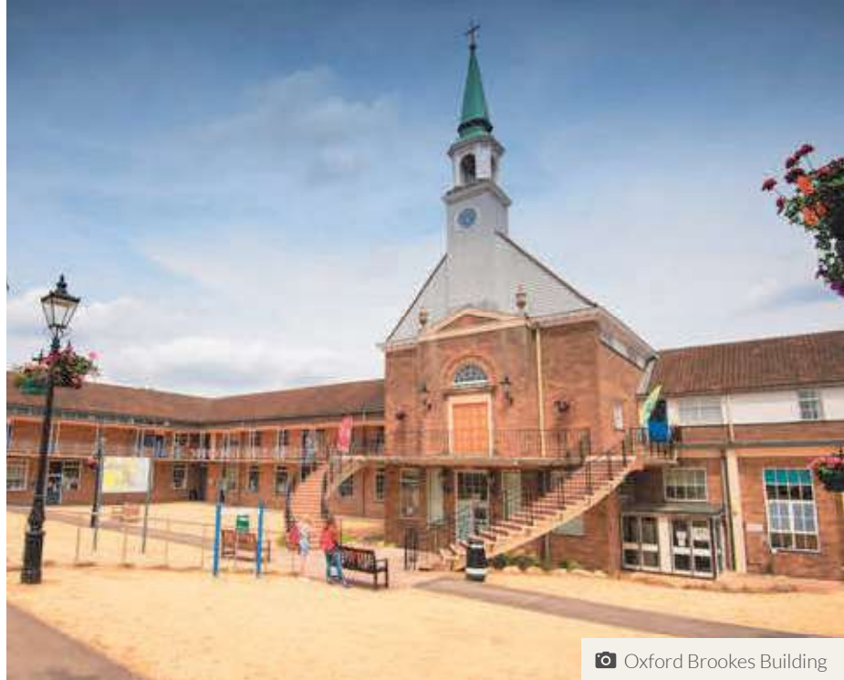
📷 Oxford Brookes Building

*All students must be born before 1/1/2011