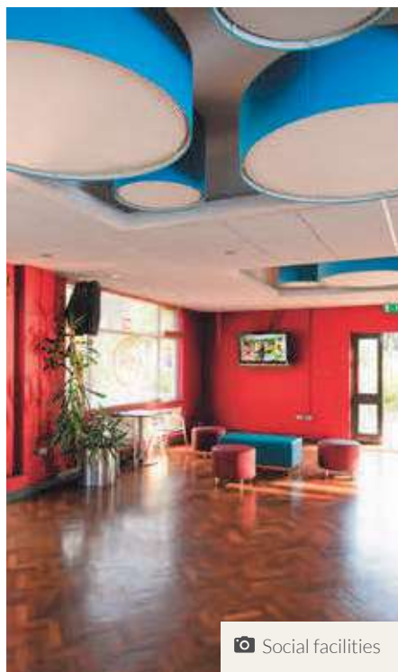
📷 Social facilities